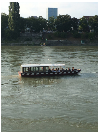
Ferry tales, 2018