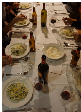
Kitchen's Best, 2019